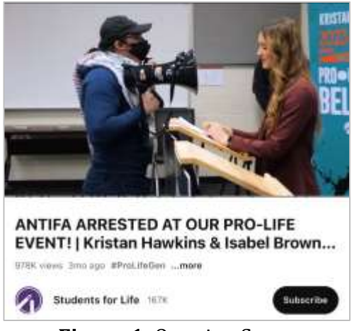
Figure 1. Opening Scene

At the beginning of the video, it was clearly shown that one side was not letting the other side convey their speech by intervening in their talking. This specifically was done by one of the audiences in the event who was supposed to be there to sit, listen, and ask questions respectfully. This goes in the context that the university has let the group of Students for Life hold their event in one of the campuses' meeting rooms. This means they have the right to legally share their ideas according to their freedom of speech right. The statement in data 1 was stated by one of the pro-choice audiences who was holding an amplifier, therefore not letting the speakers speak, as shown in the picture below: