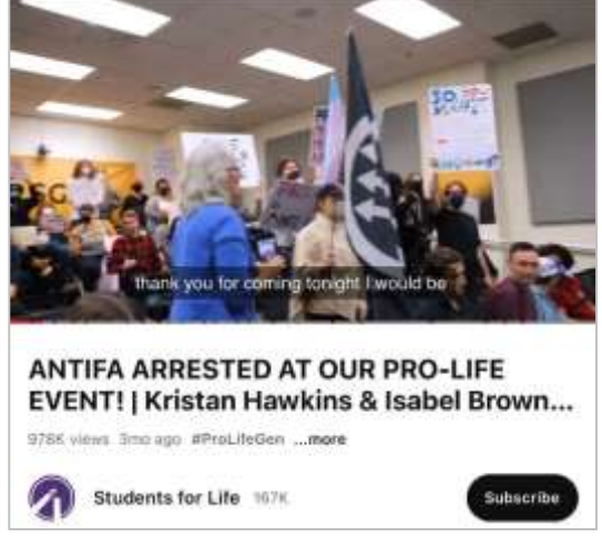
Figure 2. Scene on Minute 4:10

As stated above, the audience did not let the speakers speak. They kept screaming their arguments collectively, overrunning what the speakers had to say, causing the speakers to compete with the loud voice of the audience, as shown in the picture below: